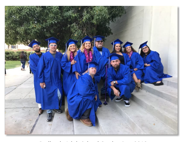
Redlands Adult School Graduation, 2018